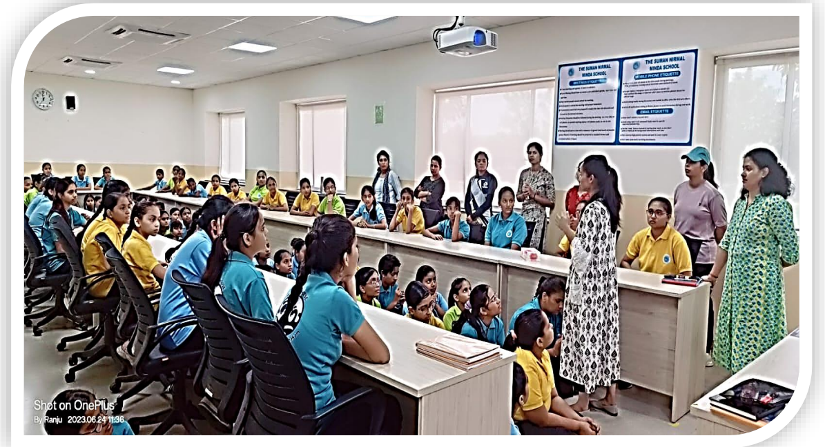
Shot on OnePlus 2023.06.24 11:36